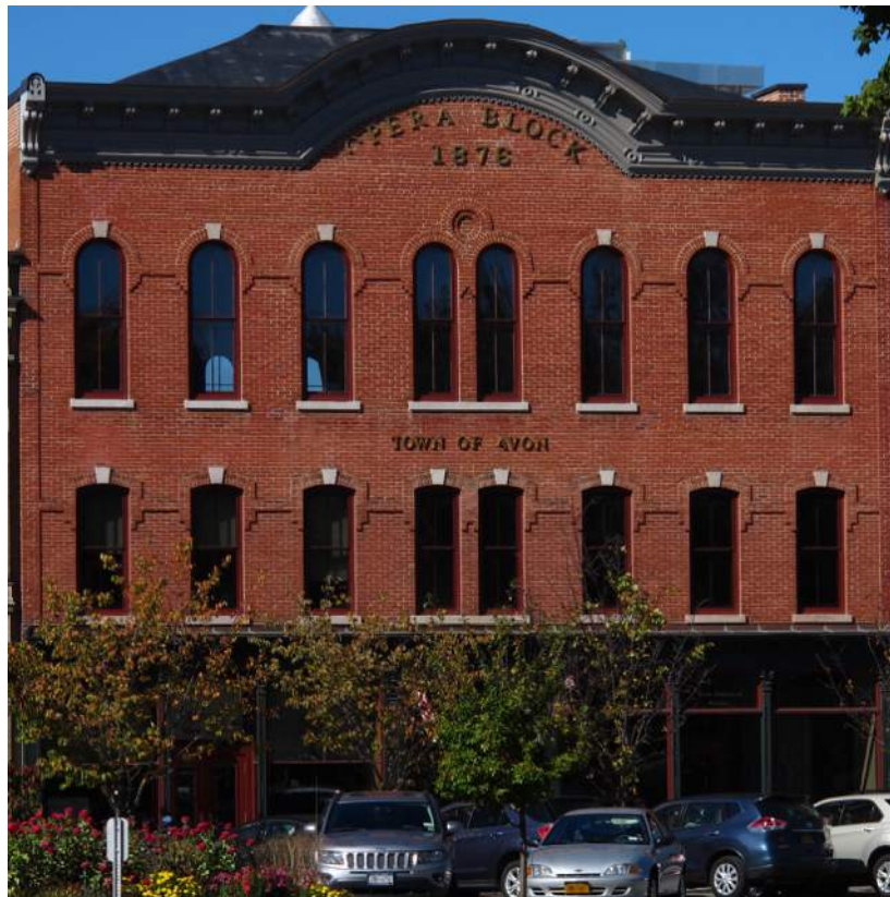
Present Opera Block

The Avon Preservation and Historical Society is honored to lease museum space on the ground floor of this historic building. The museum houses Avon artifacts and is open to the public on Thursday and Sunday, from 1 – 4 pm. Free tours of the third floor are offered during the Corn Festival in August, and by special appointment. There is renewed interest in securing additional grants to complete the restoration of the third floor to its original use: community space for recitals, lectures and programs. If successful, the Hall's Opera Block may once again be a cultural center for Avon.